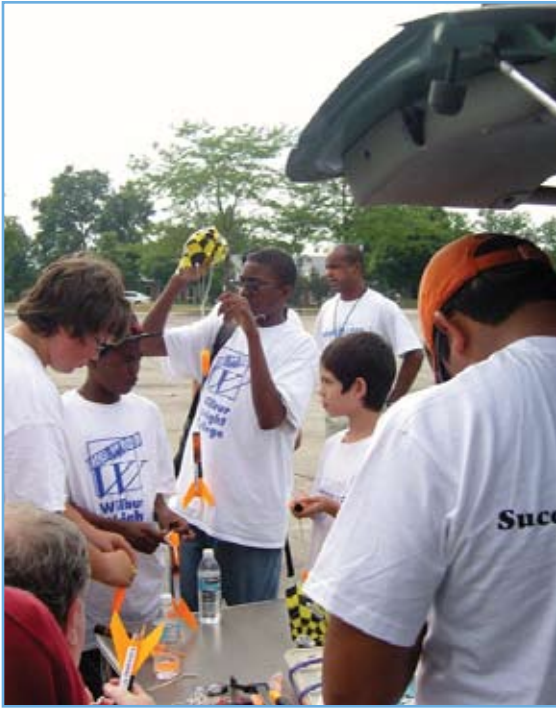
Students prepare to launch the rockets they built during the ACE Camp.

Wilbur Wright College 4300 N. Narragansett Ave. Chicago, IL 60634